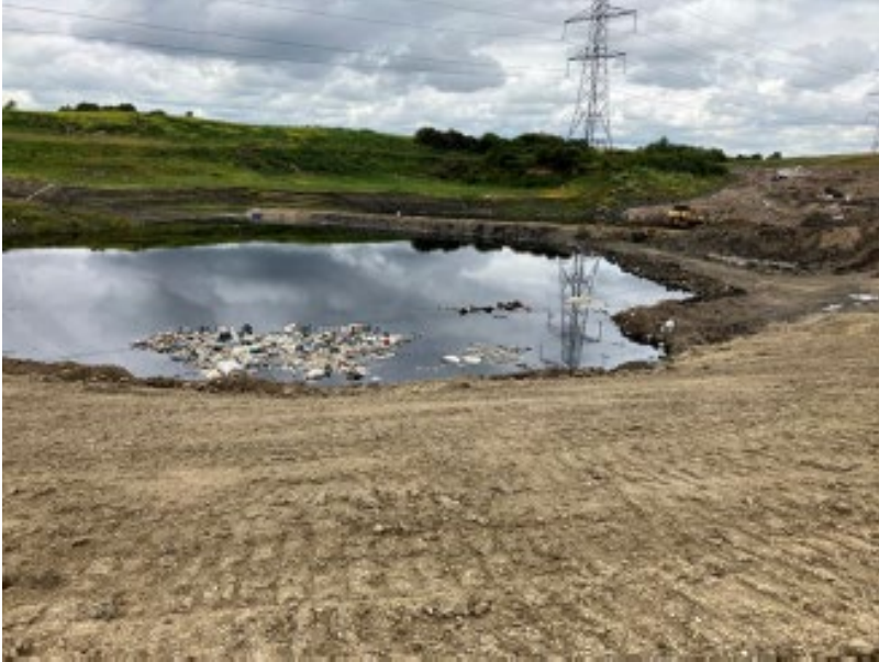
This picture shows the pool of leachate that has formed on the Sutton Courtenay landfill.