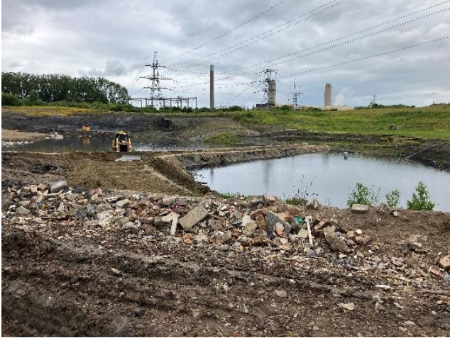
Ponded leachate on site 8 July 2024

Since we became aware of the problem, we have worked hard to ensure FCC resolve this issue and comply with their permit. The action plan we agreed with FCC has progressed and remedial work on site is nearly complete. Most of the surface leachate has now been removed from site with the remainder due to be gone within the first few weeks of August. By end of the month, the remaining engineering work should also be finished. This includes reducing the level of leachate in the operational cell, removing contaminated material, infilling and capping the area and installation of additional gas capture infrastructure. We expect there may be some nuisance odour until the end of August while the remaining engineering work is completed and takes time to become fully effective. We will continue to inspect the site weekly, respond to reports, undertake our own odour surveys, assess monitoring results and ensure FCC continue to progress their action plan.