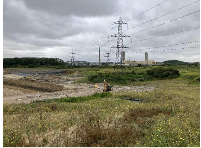
Remediated area 8 August 2024